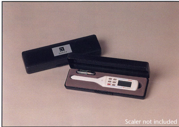
Scaler not included

Protect your investment today with its own hard plastic protective case. Purchase this accessory case and help ensure that your scaler is ready for work when you need it!